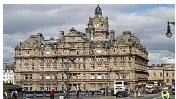
THE BALMORAL - EDINBURGH